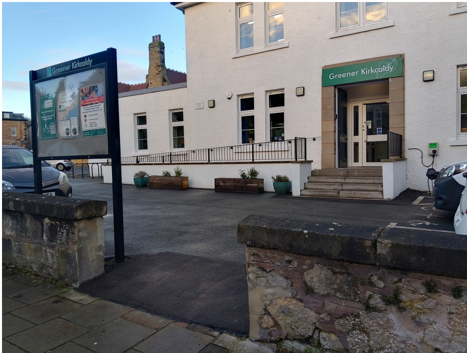
Street access to the building