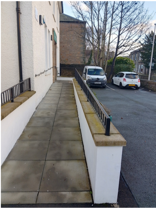
Ramp access to the building