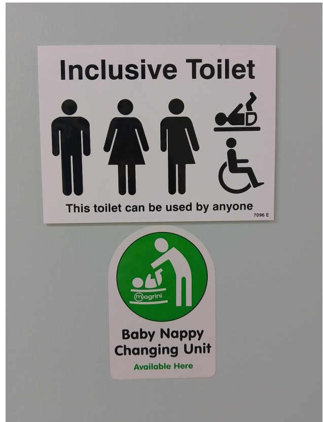
Signage for accessible toilet