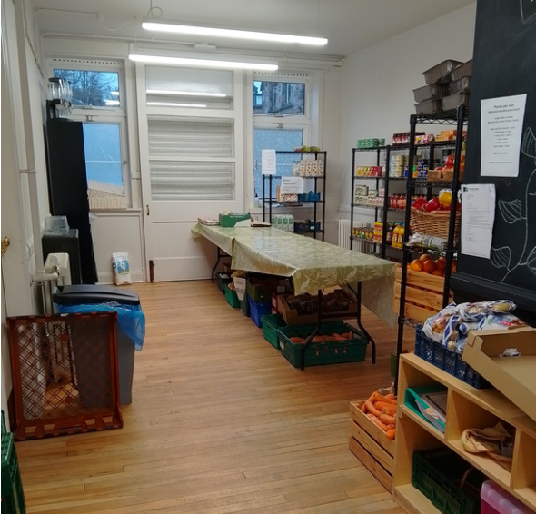
Inside the Lang Toun Larder

In order to store food this space is kept at a cool temperature.