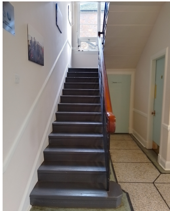
Stairs to meeting rooms