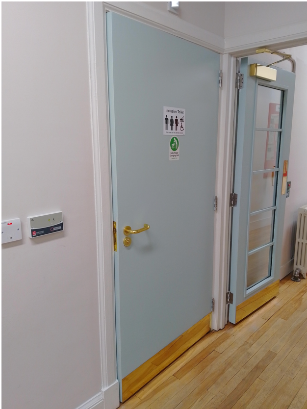
Access to the accessible toilet