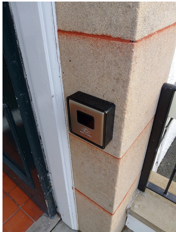
Motion sensor pad