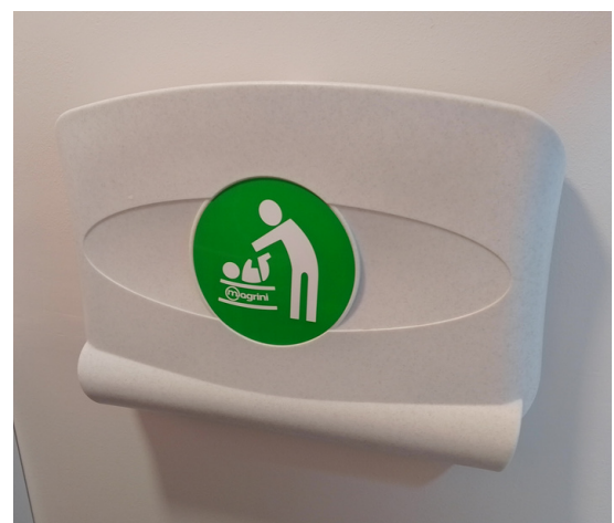
Baby changing facility