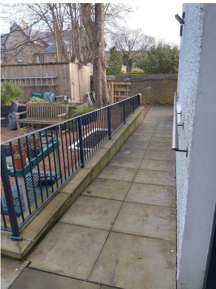
Ramp to garden

There are also a few steps with handrails on both sides to get down to the garden.