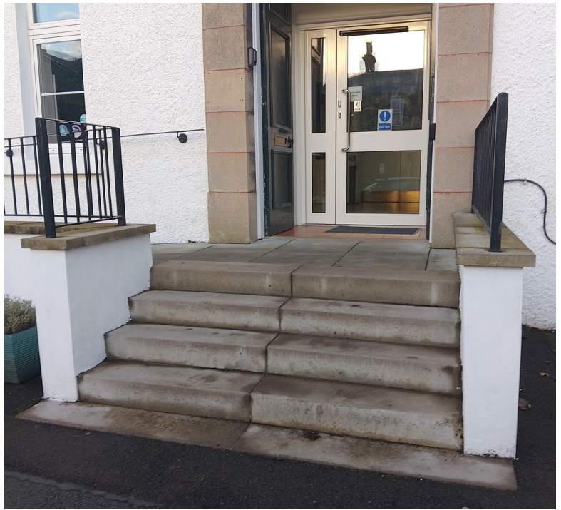
Stair access to the building

The building entrance has an automatic door, which opens inwards. The door opens by a motion sensor pad located on the right-hand side of the doorway.