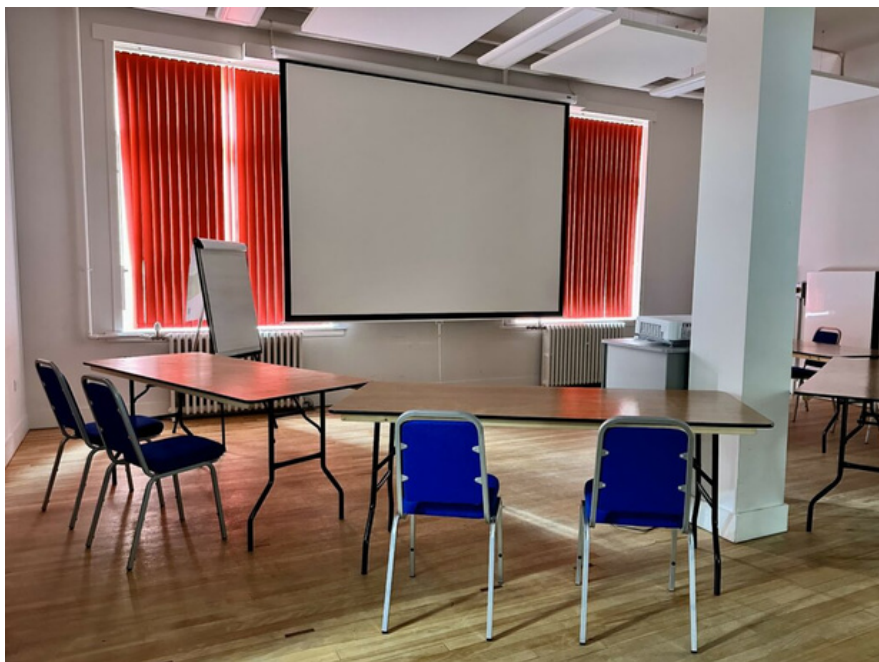
Inside Community Space

The Community Space is a large space on the ground floor with a maximum capacity of 60 people. It has level access throughout, with two supporting pillars running floor to ceiling within the room.