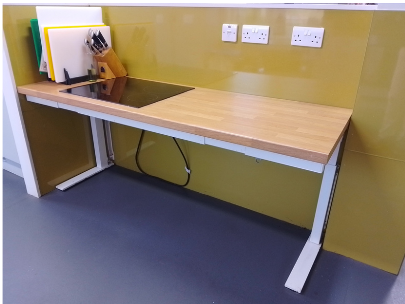
Adjustable kitchen workstation

There is a height adjustable workstation available to those who cannot work at a full height station.