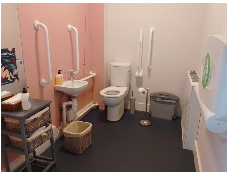
Inside of the accessible toilet