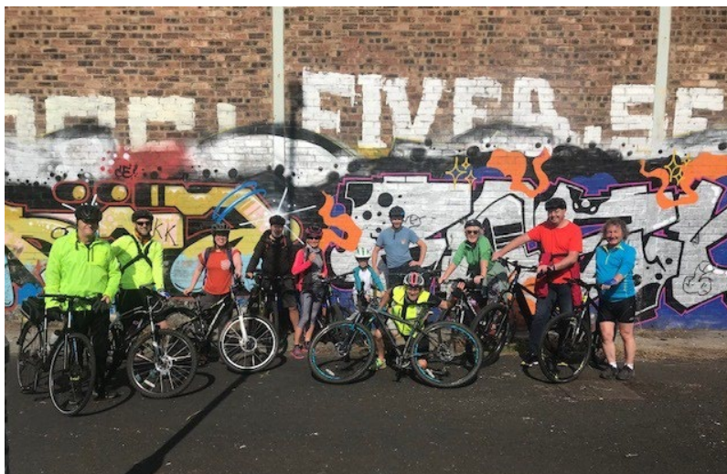
Group bike ride

We opened our social enterprise community bike shop, Lang Toun Cycles, in November 2020 with start-up funding from the Scottish Government's Climate Challenge Fund. The shop offers cycle servicing and repairs, sales of refurbished bikes and of accessories, a bike lending library, bike maintenance training, volunteering opportunities and work placements. Our first 18-months have shown that there is a definite need for a community bike shop in Kirkcaldy. The Covid-19 lockdown and current cost-of-living crisis are meaning more and more people are now choosing to cycle, both for exercise and active travel, and we have seen a very high demand for our bike repairs, services and second hand bike sales. The bike library is also very popular, with people particularly keen to borrow electric bikes. We are currently trialing selling new e-bikes. This has been a great success so far, with the bikes selling within days of going on the shop floor. In 2022-23, we are exploring new options for business-to-business selling and creating an online presence for selling bikes and accessories.