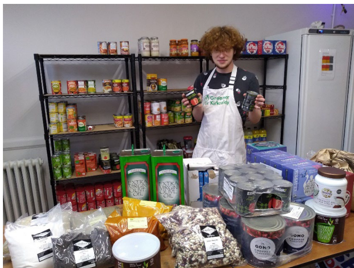
'Kickstart' placement helping in our community pantry

We have been supporting young people to gain work experience by offering placements in our kitchen, garden and cycle shop as part of the Government's 'Kickstart' programme and Fife Employability and Training Consortium's 'Bright Futures' project. Over 100 young people have been supported so far.