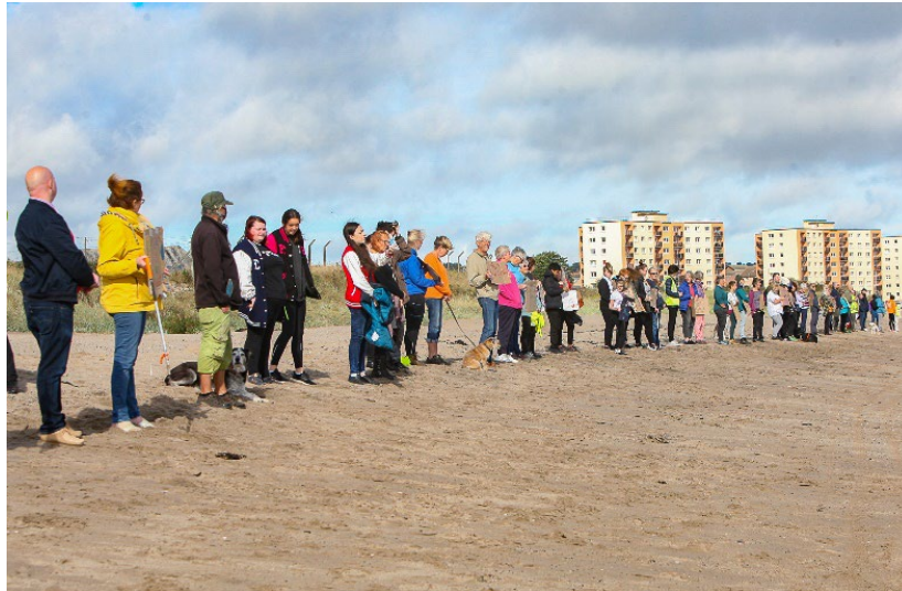
Climate Action Fife 'Line in the Sand' event

We used the learning from our development project to successfully apply for a follow on 5-year project. This will be funded by the Climate Action Fund between 2022 and 2025 and is working with 12 community and public sector partners to deliver an ambitious programme of climate action, including: