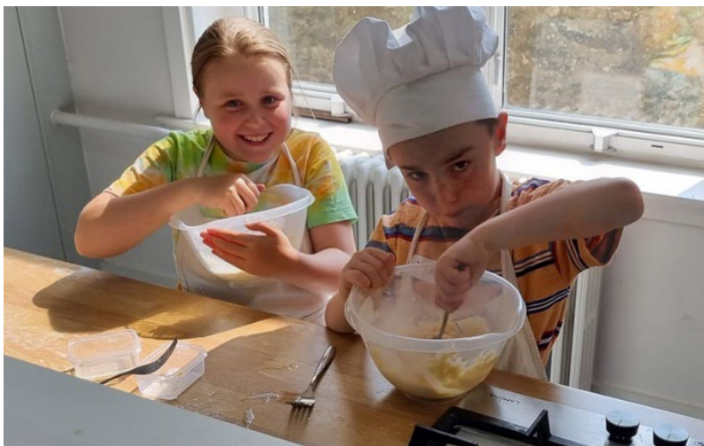
Kids club in the Lang Spoon Community Kitchen

Our activities have been very popular over the last year, with most of our classes selling out, our programmes fully booked with waiting lists and 150-250 people joining us for our community meals each month. Participants were very enthusiastic about getting back in the kitchen and we have received excellent feedback from our community.