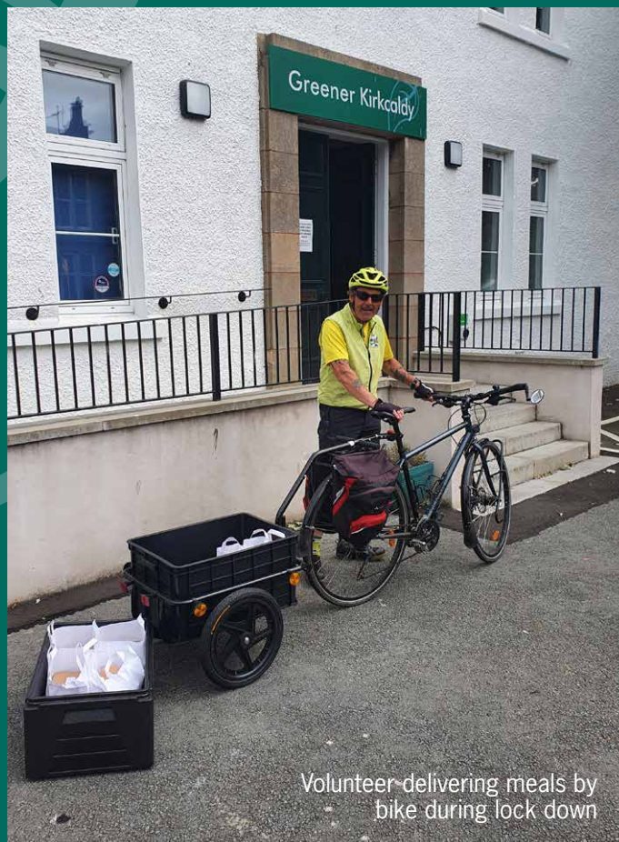
Volunteer delivering meals by bike during lock down

During the first lockdown our Community Food team staff and volunteers provided food aid and social support. We distributed 7,500 meals to vulnerable people between April and August 2020. We made direct deliveries to over 100 households with a friendly doorstep chat, and distributed additional meals via partner organisations.